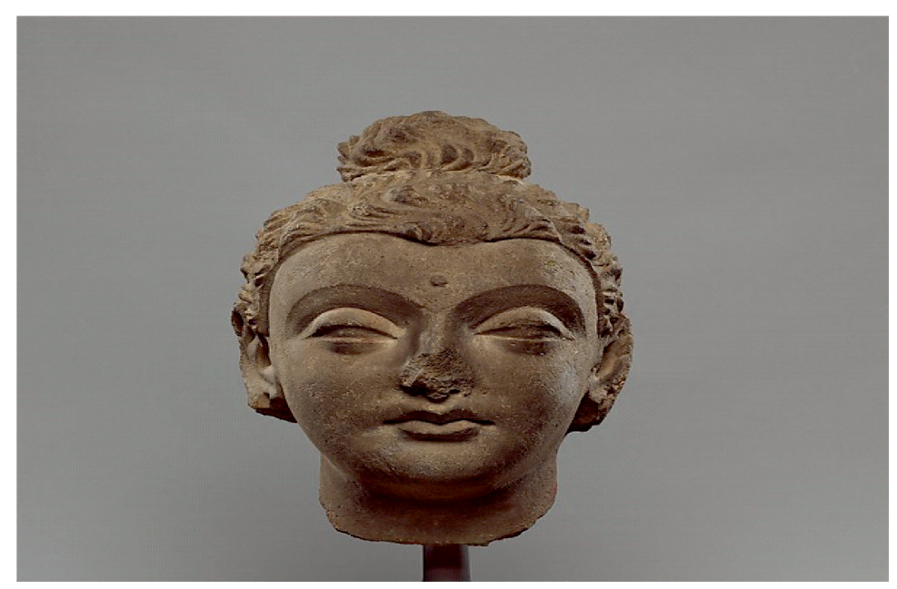
Fig. 1: Head of Buddha stucco 3rd-4<sup>th</sup> century https://www.metmuseum.org/art/collection/search/38777

In Gandhara art, the head of Buddha has practically all the attributes with a high Usnisa, .The arrangement of the hair in concentric curves which also cover the Usnisa Arched hairdressing is also known for Gandhara schist sculptures (Ingholt; 1957:119, fig 246) as also parallel vertical curls descending from the Usnisa to the forehead (Ibd,123-124,fig 256). Various manners of representing the hair can be seen. The tuft show undulations starting backward from the line of the scalp or left and right from a central line dividing his hairstyle into symmetrical parts this undulation can become very short and lead the way to snail-shell curls which cover the scalp and the top knot similar to the hairstyle seen Mathura and elsewhere in South Asia from the fourth century onwards (Fig. 1) (Picron: 2009;183).