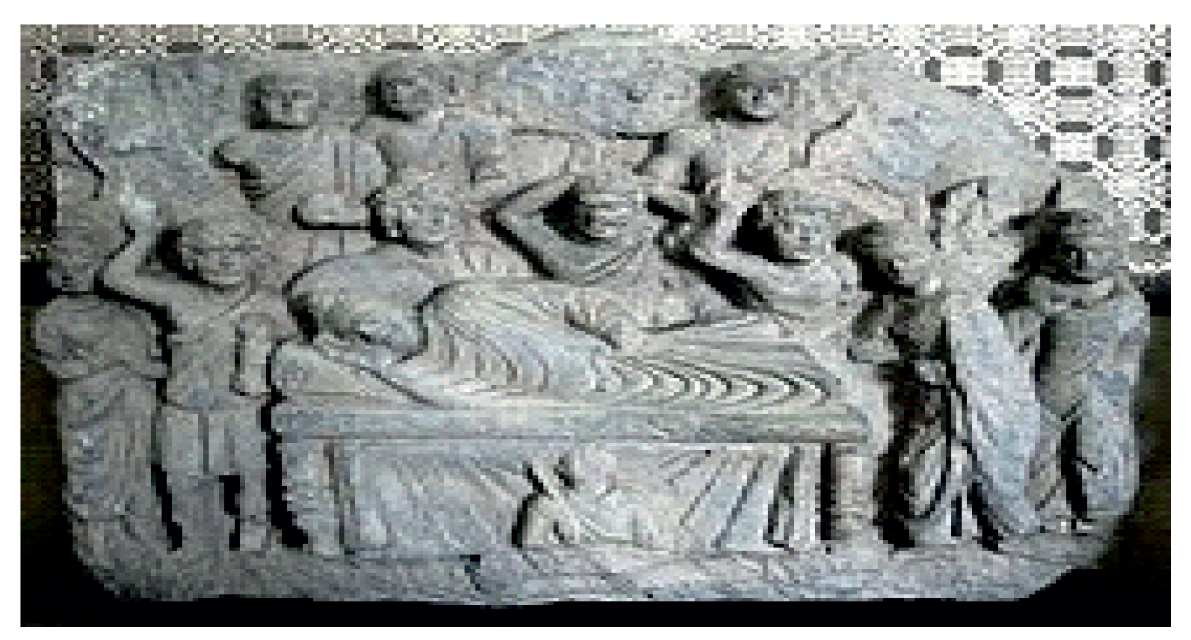
Fig. 5: Laying Buddha schist (death scene) 1<sup>st</sup>- 2<sup>nd</sup> A.D https://en.wikipedia.org/wiki/Parinirvana