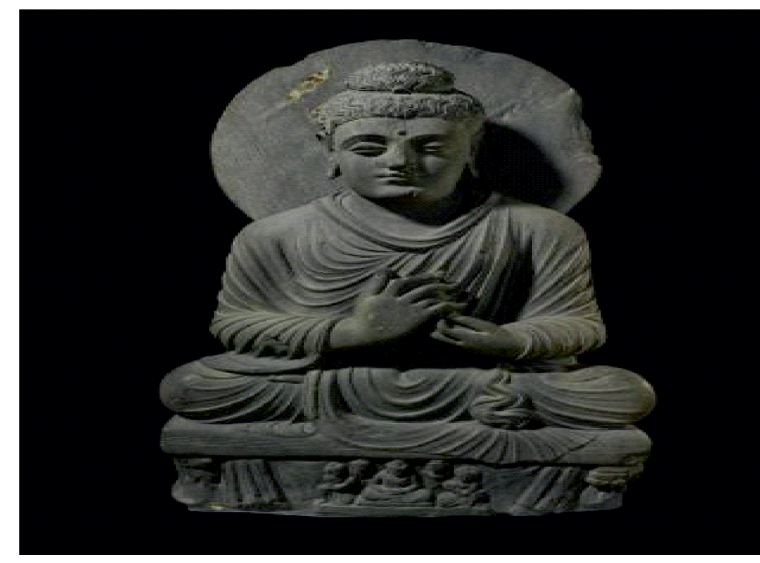
Fig. 2: Seated Buddha 3<sup>rd</sup> -4<sup>th</sup> century British museum http://masterpieces.asemus.museum/masterpiece/detail.nhn?objectId=10311

seated Buddha (Fig. 2) is an unusual creation of Gandhara artists, have no classical or Indian example available. The model of a standing Buddha may have been copied from a Greek god Apollo or even a Roman emperor wearing toga because the Kushans certainly had diplomatic and commercial relations with the Roman West But further than this exercise come to an end. The Buddha takes the standing position when coming down from the (Cunningham; 2002:29) Gods Heaven after taught the Buddhist law of his mother and the Gods (Fig. 3). The Buddha stands to a height of 2.64m and is the tallest statue known from Gandhara. The great Buddha of 38 to 55 m carved out of the rock at Bamian in Afghanistan is an exceptional expression of this tendency but unfortunately blasted some years ago. Among the thirty chapels at Takht-i-Bahi in what was called the "court of colossi", between the main stupa and the monastery, some, when first seen was still from 25 to 30 feet (8.375-10.05m) in height.