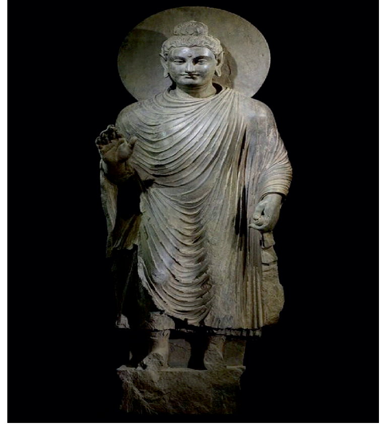
Fig. 4: Walking Buddha 2<sup>nd</sup> -3<sup>rd</sup>- century

The Peshawar Museum has recently acquired a stucco head 52 cm in height. (Juhyung; 2007 :1-6). At the Dharmarajika at Taxila, now incomplete stucco image housed in a chapel of which the walls were evidently intended to support considerable weight, would, from its proportions, had reached a height of 10.675m (Marshall; 1951 :268). The size of available stone blocks and the difficulty of transporting them did put some restraint on the dimension of independent images. But the zealous Buddhist artists found a way out: clay and stucco, the more amenable materials, could address the problem of achieving greater height. A number of further walking scenes of Buddha depicted in the images in Gandhara art (Fig. 4). The lying position (Fig. 5) is kept for only his Mahaprinirvana and his last departure or death scene where he is stretched right side sideways on a bed, head towards the North and also given the impression towards the west. A large number of images, sculptures are shown sitting and standing, often he is surrounded by devotees, the monks, lay followers, gods, Bodhisattva by listening to his sermons, present a more conceptual and iconic version of the Buddha. Such images do not necessarily represent the historical Sakyamuni, but show his more delicate qualities and features that remain invisible to the human eye. Not all images of the Buddha, however, can be known as representations of his exact life story.