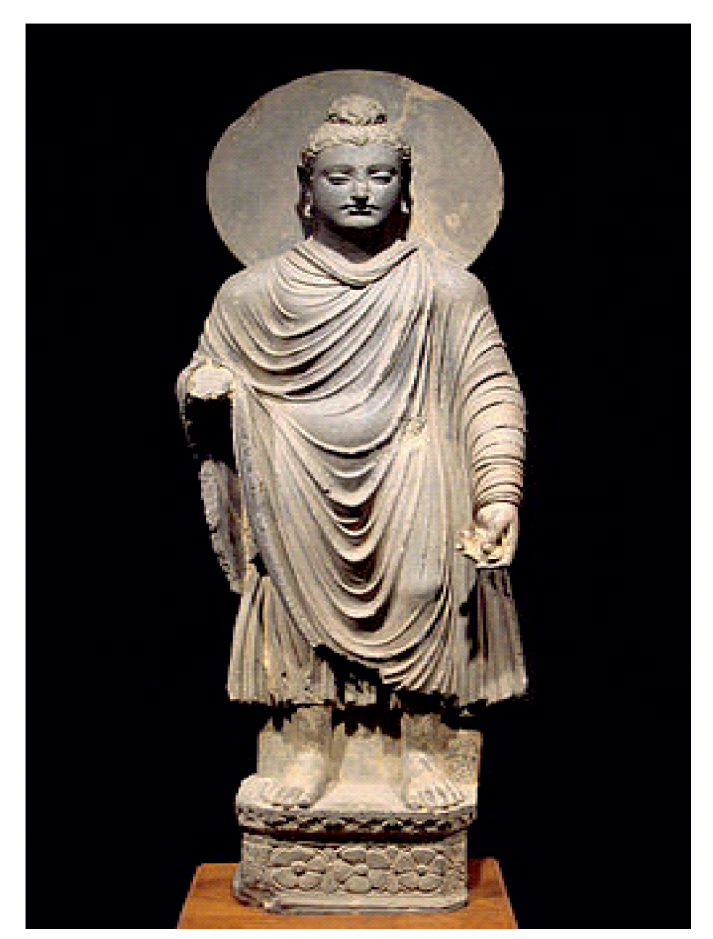
Fig. 8: Robe of Buddha https://en.wikipedia.org/wiki/Physical_characteristics_of_the_Buddha

upper garment and the Sanghati, covering the right shoulder or leaving it bare, is closely related to the attitude of the Buddha and the position of his hand.