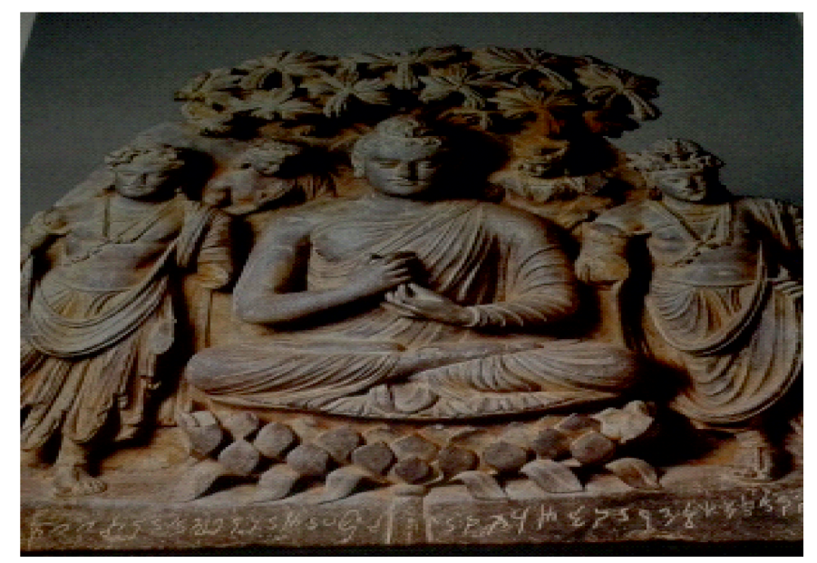
Fig. 6: Teaching Buddha from Sahri Bahlol Peshawar Museum

The term mudra (pose) is used to designate certain important gestures performed by the hands are of special significance. The gesture presented by one or both hands puts up with the name which explains their meaning. The Buddha applies his continual generosity in offering his compassion and love to the devotee, a moral attitude which is expressed through the right hands. In Buddhist text, a lot of mudras introduced but in the Gandhara art, only a few mudras appeared. The most common are four mudras and can also be displayed when the Buddha is sitting position, but whereas in the standing position the left hand always holds the edge of the dress. The First mudra called "Dharmacakrapravatanamudra" turning the wheel of the law a preaching gesture, (Fig. 6) is expressed by bringing both hands before the chest. In this gesture, the Buddha shows as a teacher and he slightly bends the right hand to himself in front of the chest, the thumb of the left hand, also slightly the closed, joined the index finger and look to enter into the lower part of the right hand. This very exacting gesture is showing when he teaches his ethical principle (Picron: 2008:182).