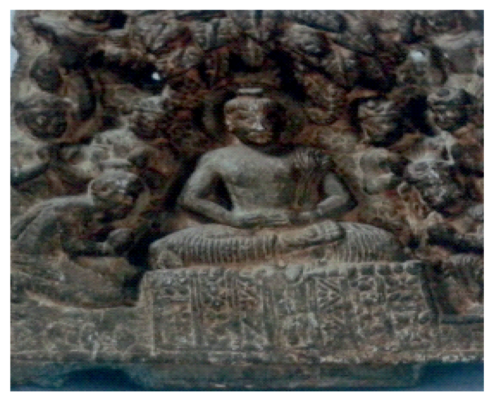
Fig. 7: Meditating Buddha Butkara (Swat)